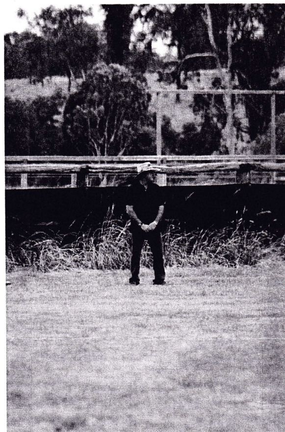
Strop waiting for someone to hit a ball to him.

What did the spider do inside the library computer? It made a web page.