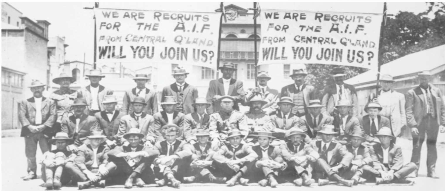
Recruits from Rockhampton and district, pictured with recruiting banners in Brisbane before entering camp. The banners read: " We are the recruits for the AIF from Central Q'land will you join us " and may have been used in one of the recruitment marches which happened around Australia. Published in the Queenslander 24 November 1917, page 22, the original caption reads " A party of recruits from Rockhampton who recently marched through Brisbane to help the volunteer movement. "

Ref: https://www.awm.gov.au/articles/encyclopedia/enlistment